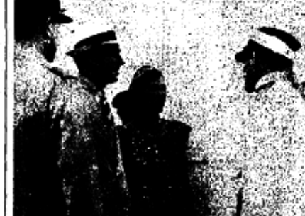
Their Excellencies Lord and Lady Mountbatten speaking to Service representatives at the Mariner Airport on their arrival in Karachi from Delhi on Wednesday.